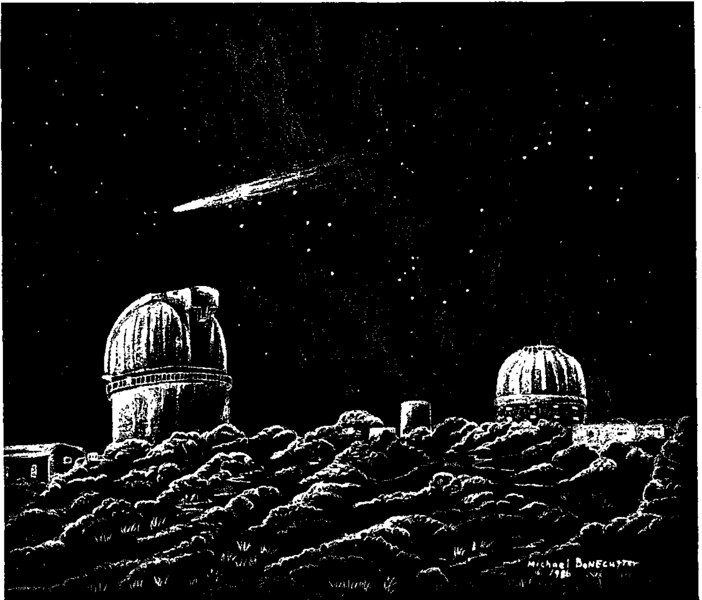
COMET HALLEY FROM McDONALD OBSERVATORY